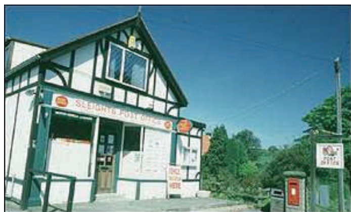
Sleights Post Office near Whitby

To build on the previous discussion in Yorkshire and The Humber, a special single issue meeting will be held mid February to identify whether there is sufficient common ground for a regional response to be submitted by the Rural Affairs Forum. This will include members of the RAF Steering Group, Rural Practitioner's Access to Services Task Group and interested RAF members (who had responded to the proposed meeting). The outcome of these discussions will be communicated to RAF members.