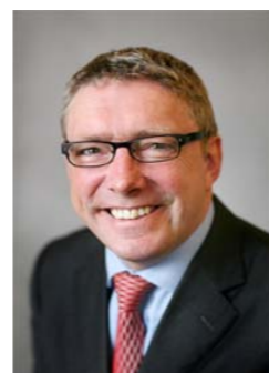
Phil Hope Minister for the East Midlands